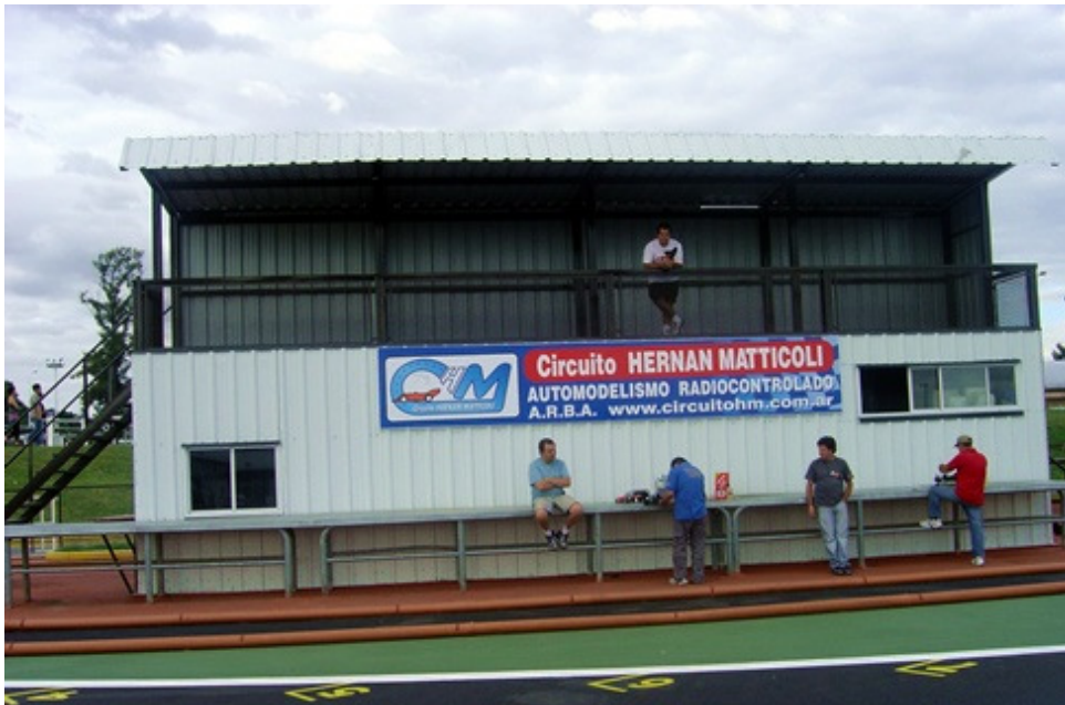
Drivers Stand, Tech inspection, Judge's room and timing room.